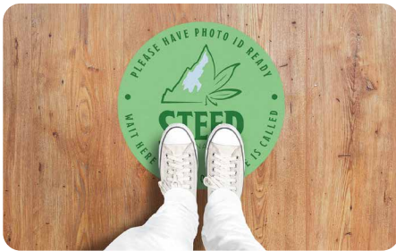
No. 988, 998, & 4988 | Any Size & Shape