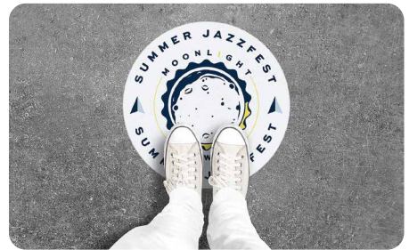
No. 4996 & 4997 | Any Size & Shape