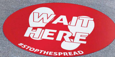
No. SD001 | 12" dia.

Available to ship in 1 day and priced at a significant discount!