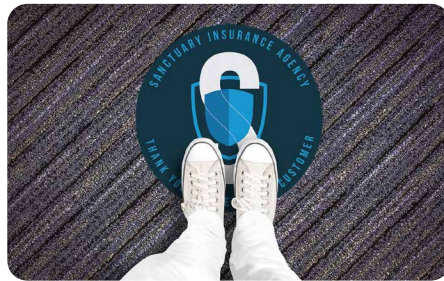
No. 4991 & 4992 | Any Size & Shape