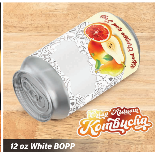
12 oz White BOPP

Print beverage labels and promotional stickers at the same time with custom Drink 'N Peel Labels. Our innovative multilayered construction provides the flexibility to print the required beverage label information and an internal die-cut sticker for the consumer to easily peel out and stick to nearly anything. Simply provide your art with a die line telling us where to kiss cut the sticker. Consider outlining the sticker portion of the label or including an arrow and instructions to "peel here" next to the sticker. Choose from either silver or white BOPP with a matte overlamination creating a pen-receptive surface.