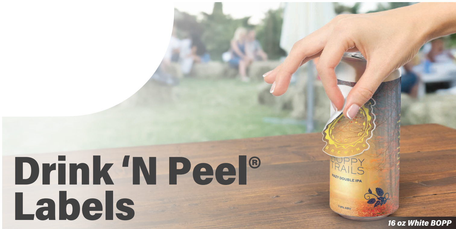
16 oz White BOPP